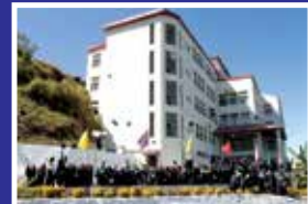
The ICFAI University, Mizoram