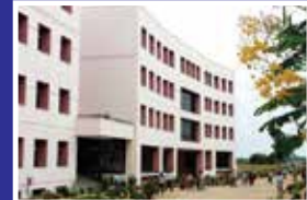
The ICFAI University, Tripura