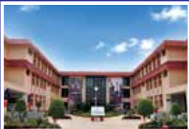
The ICFAI University, Dehradun