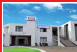
The ICFAI University, Jharkhand