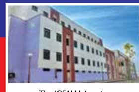
The ICFAI University, Himachal Pradesh (Baddi)