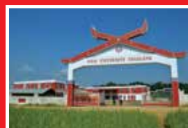
The ICFAI University, Nagaland