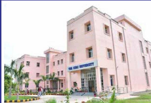
The ICFAI University, Raipur