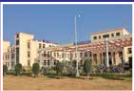
The ICFAI University, Jaipur