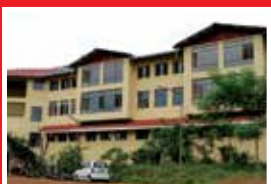
The ICFAI University, Meghalaya