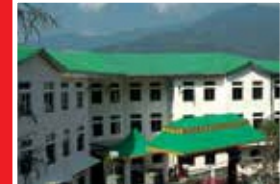
The ICFAI University, Sikkim