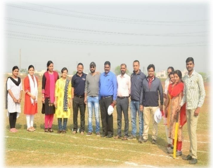
i-spardha glimpse (Inauguration in the ground)