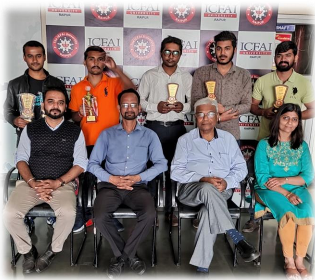
i-spardha Prize distribution